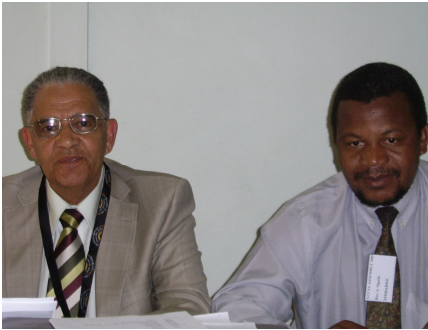
The Minute Secretaries