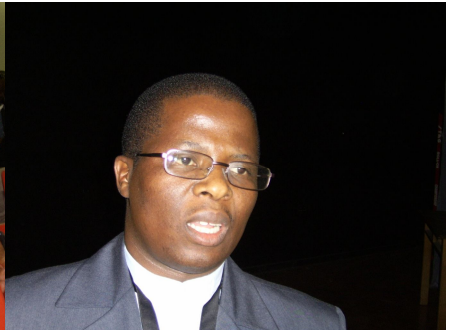
The General Secretary