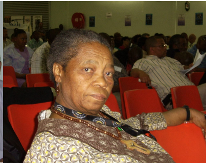
Our Assembly preacher