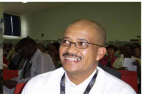
The Assembly Chaplain