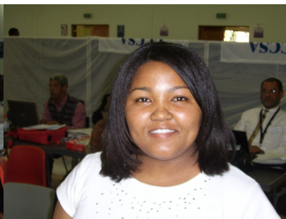
The Greetings Convenor