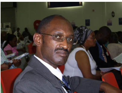
Convenor of Scrutineers