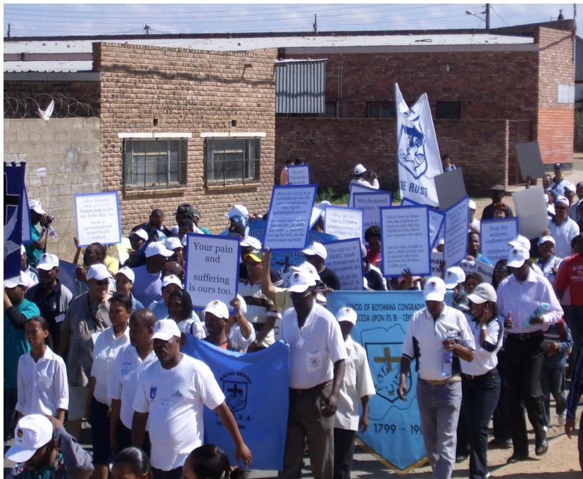
On Saturday, delegates went on a "Solidarity for our Zimbabwe People" march.

There were several displays of gymnastics and dancing by young people. After lunch, served African, South African, Indian and Chinese style, plaques were presented to the past Chairpersons and Presidents who were present.