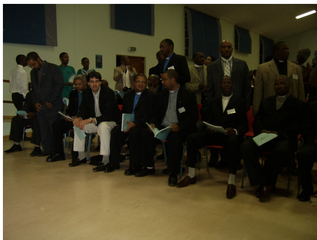
Some of the ministers ordained since the last Assembly