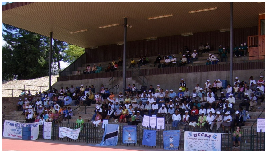
Some of the crowd and the banners at the sportsfield on Saturday